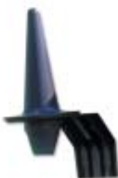
7825 Weatherproof Outdoor Antenna