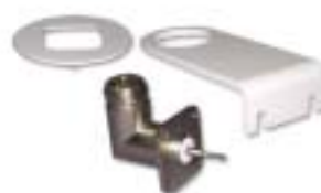
7820ANT* Antenna for Vertical Mounting