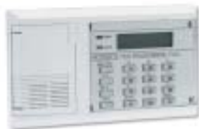
7720P Programming Tool