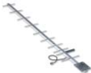
7674-13 Directional Antenna (13dB)