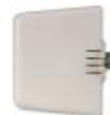
7825DP Dipole Antenna for Vertical Mounting