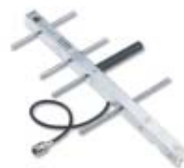
7674 Directional Antenna (6dB)