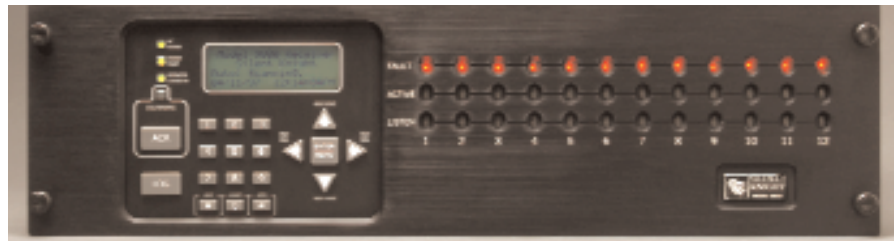
9800 Digital Alarm Receiver

For ease of use, the 9800 receiver features a modular design that isolates the MCPU from the line