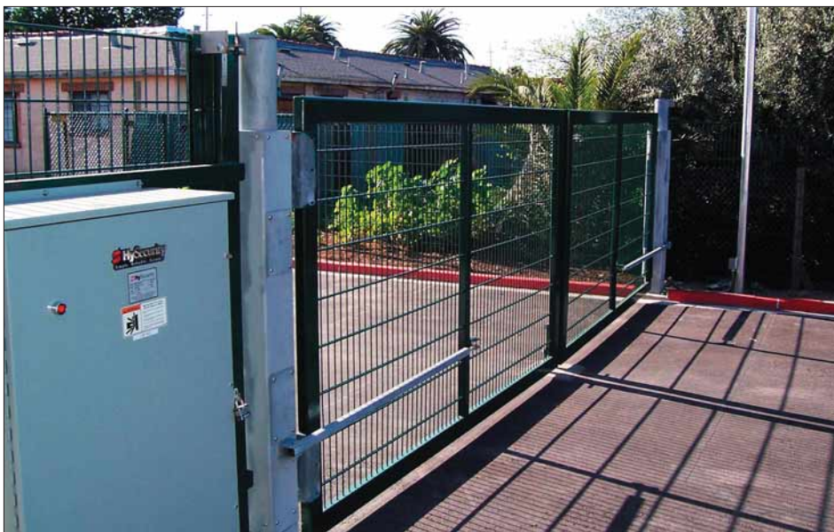
Separate electrical enclosure (left) operates both gate panels in unison in this SwingRiser Twin configuration.

Detailed maintenance instructions are available online at www.hysecurity.com . Brief maintenance guidelines are described below.