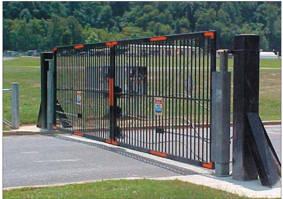
SwingRiser 30 Twin operating heavy crash gates installed at Camp Dawson training facility in West Virginia