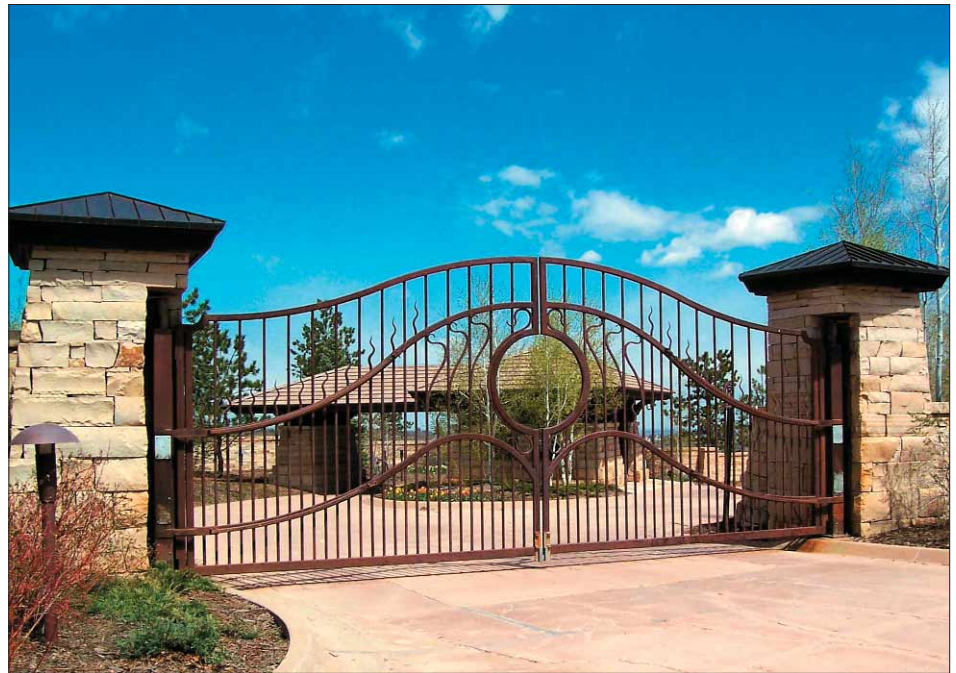
SwingRiser 19 Twin UPS with ornamental iron bi-parting gate installed at Colorado private golf course entrance